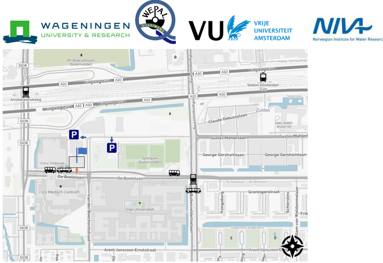
The main visitor entrance is on the De Boelelaan side of the building (see orange arrow).